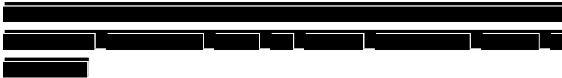
Figure 5.6.3-2. Qwest’s Technical Approach to WCS Features