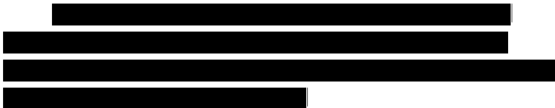
Figure 4.2.1-3. Qwest Provided VS Interfaces at the SDP

Qwest provides standards-based VS interfaces as required for Networkx services. Figure 4.2.1-3 summarizes our support for required VS interfaces, including the proposed SEDs. The Qwest voice network interoperates with interface equipment specified by the Government, such as single-line telephones, Secure Telephone Unit (STU) III, multi-line key telephone systems, conference room audio equipment, PBX, Centrex, T-1 multiplexer, modem, fax, and video teleconferencing systems.