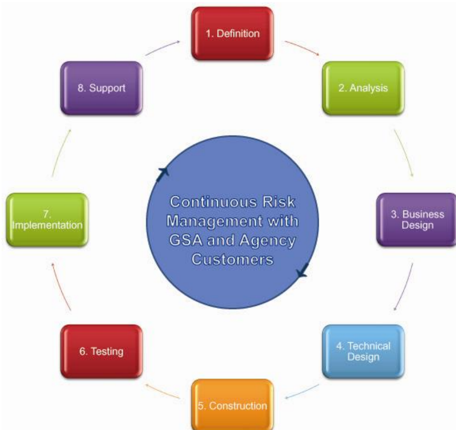
Figure EX-4: Level 3's repetitive transition process ensures smooth transition of services to Level 3's network