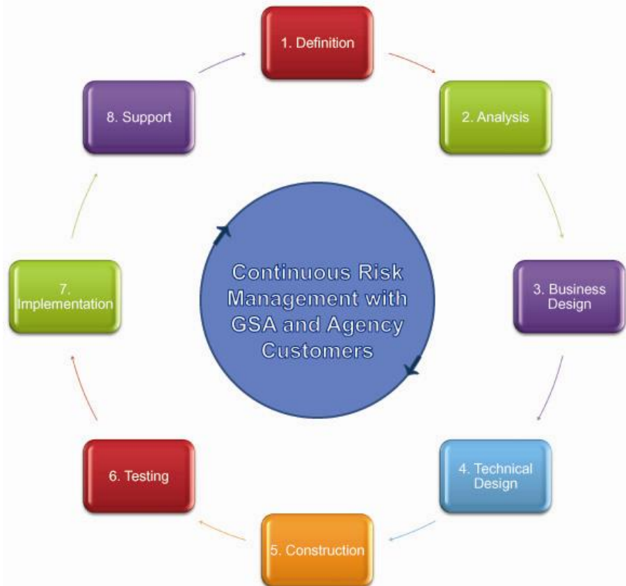
Figure EX-4: Level 3's repetitive transition process ensures smooth transition of services to Level 3's network